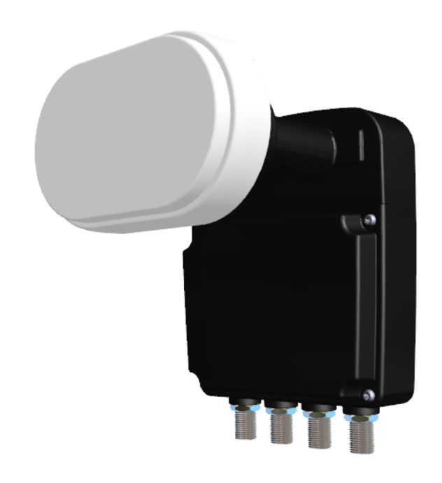
Click object to rotate